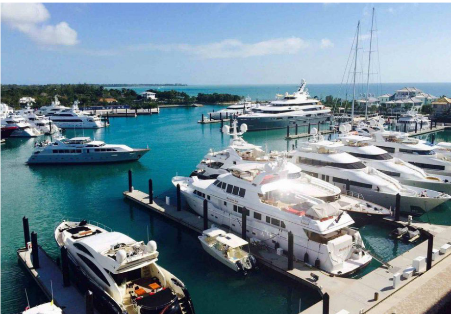
Albany's 71-slip Mega Yacht Marina

The latest build is called Tetris and it's one of four buildings which will be constructed over the next few years. Due to open in 2020, and conceived by OOAK Architects , a female-led Swedish architecture firm, it will add to the already substantial architectural prowess displayed here. Bjarke Ingels Group (BIG), which counts the Google HQ in California and New York's 2 World Trade Centre (the latter is currently under construction) under its belt, and Morris Adjmi Architects , which designed Brooklyn's Wythe Hotel , are just two of the big-hitter names which have already masterminded buildings at Albany.