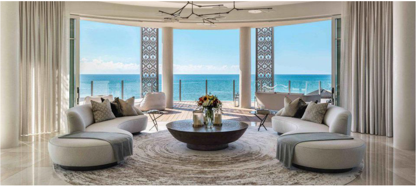
Inside one of the private Marina Residences

Holidaymakers can also choose to stay in colonial-style, ocean-front homes, where the pristine beach is just steps from your door, or Club Villas, which have a palatial feel with inner courtyards and pavilion-enclosed swimming pools. Marina Residences, such as those in The Orchid, which is sheathed in trellis-style, aluminium panels cut in a floral pattern, are vast and uber-glamorous, with floor-to-ceiling windows and wrap-around terraces. For something spectacular, the top floor penthouse – with a lift that opens directly into it – has a circular living space, marble floors and custom-designed furniture.