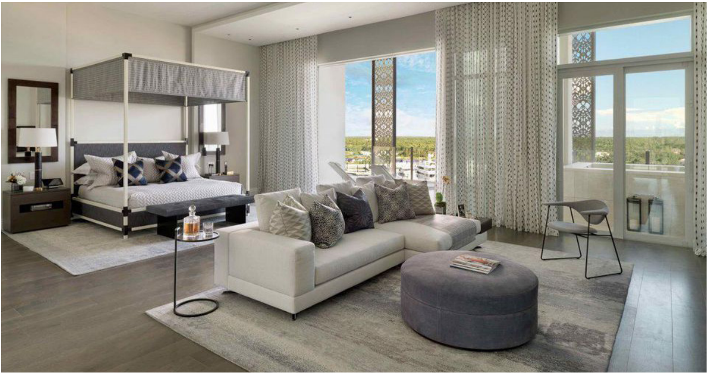
Residences inside the Orchid building are sleek and sophisticated

Not surprisingly, perhaps, all the Tetris properties have already been sold to buyers wanting a slice of the Albany pie, with interested parties already ‘queuing’ for projects which have yet to break ground.