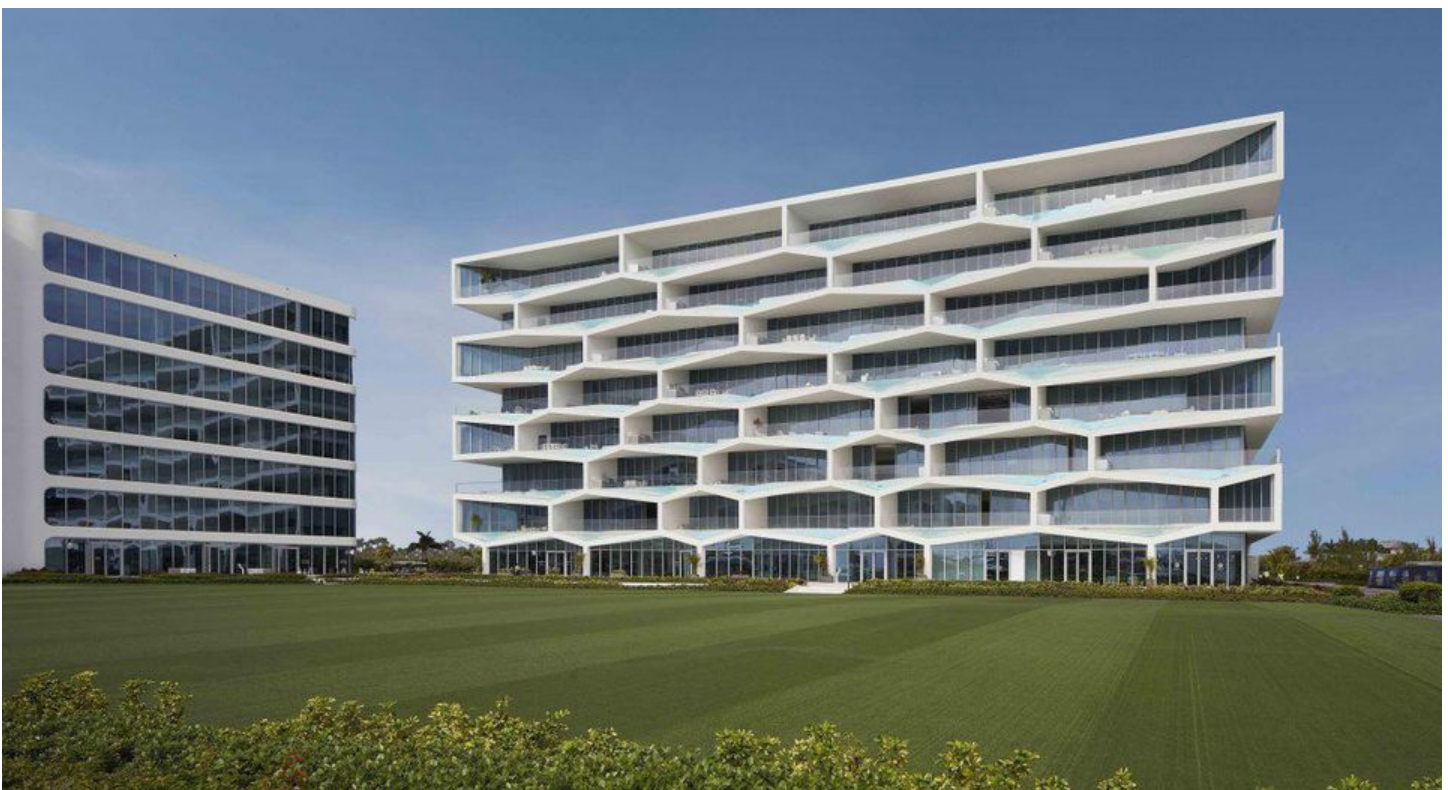
The Honeycomb Building

Standing in a half-built concrete building, with the Bahamian sun blazing down, is a revelation. This is Albany – one of the world's most exclusive resort communities located on New Providence Island in the Bahamas – and, it's likely that you may not have heard of it. Owned by British billionaire Joe Lewis and his private investment organisation Tavistock Group , along with golfing greats Tiger Woods and Ernie Els and actor and musician Justin Timberlake , the ambitious development first opened in 2010 and it remains something of an under-the-radar destination for a tranche of starry residents and guests.