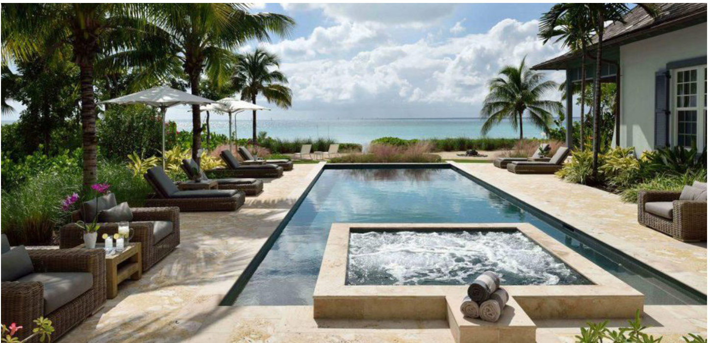
Albany House

As well as the multiple restaurants, two pools and private beaches – there's also an equestrian centre, a cinema, an art gallery, hair salon and a state-of-the-art boardroom facility, called The Bullpen (named after 'The Charging Bull' by Arturo Di Modica whose work of the famous Wall Street Bull sits in both the Financial District in New York City and on the Marina Plaza at Albany overlooking the harbor).