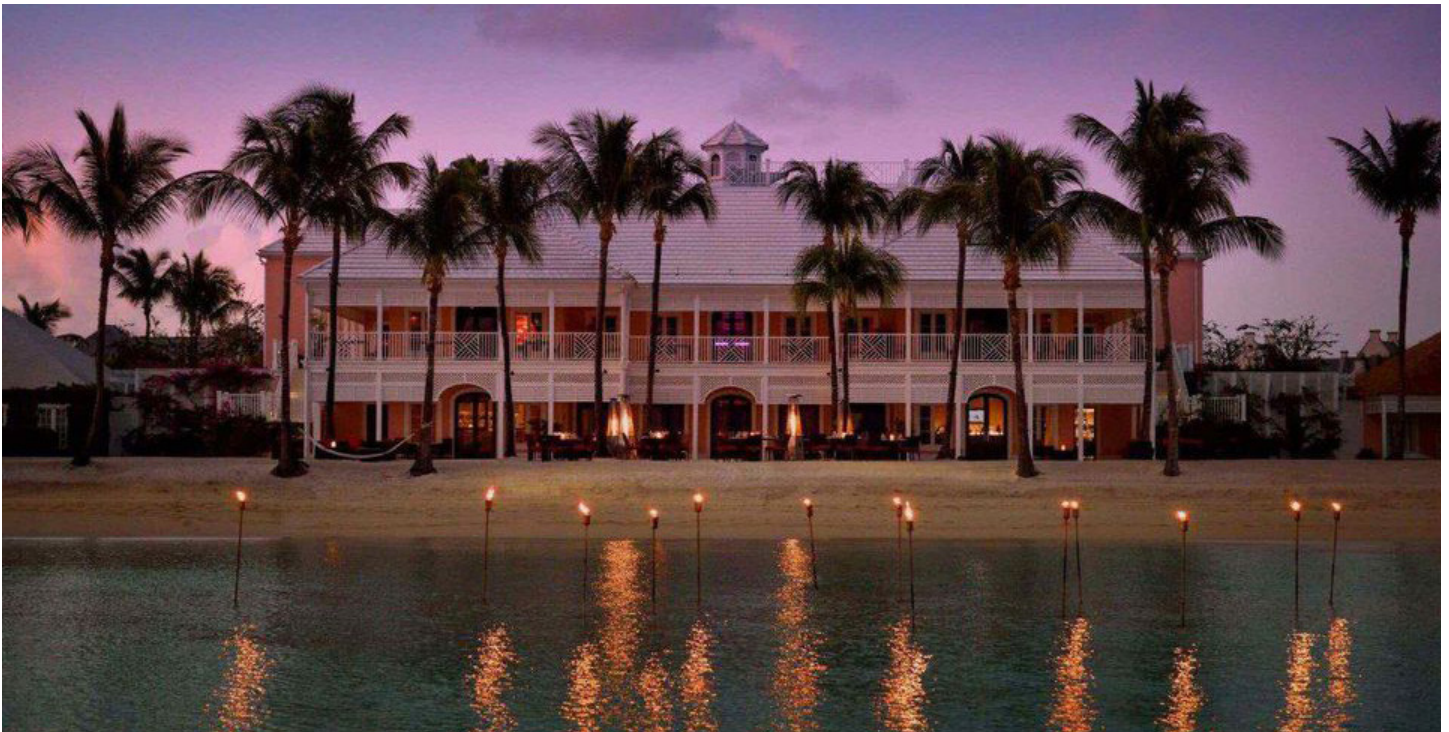
Albany House