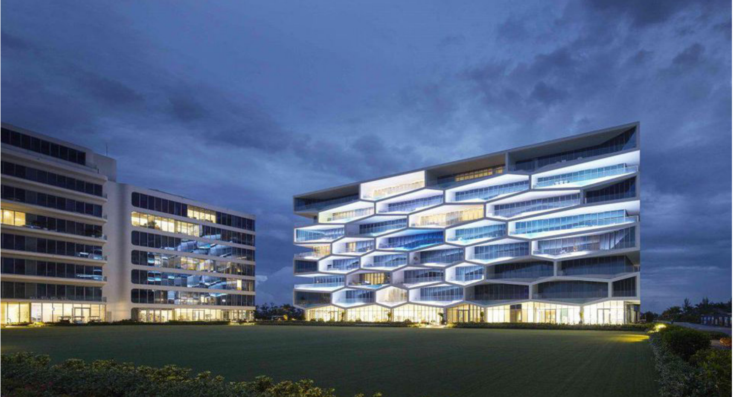
The Honeycomb at night

The latest build is called Tetris and it's one of four buildings which will be constructed over the next few years. Due to open in 2020, and conceived by OOAK Architects , a female-led Swedish architecture firm, it will add to the already substantial architectural prowess displayed here. Bjarke Ingels Group (BIG), which counts the Google HQ in California and New York's 2 World Trade Centre (the latter is currently under construction) under its belt, and Morris Adjmi Architects , which designed Brooklyn's Wythe Hotel , are just two of the big-hitter names which have already masterminded buildings at Albany.