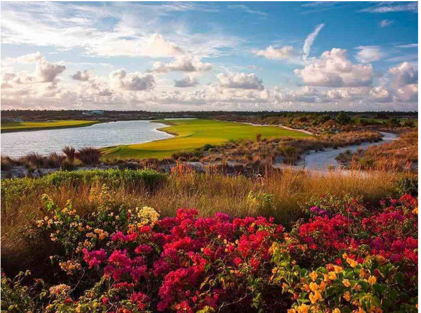
The Ernie Els Designed Championship Golf Course

Designed by Bjarke Ingels, and named after its stunning glass geometric façade, The Honeycomb apartments all have their own outdoor pools sunken into the terrace floors, so that they are dramatically transparent and visible from outside. While the exterior is spectacular, the interiors ramp this feel up even further. From an African-influenced apartment – richly textured with baskets as art work, a taupe-oyster-mushroom palette and touches of jet-black – to an ocean-referenced property – with shell-encrusted chandeliers, an azure-and-crisp-white palette and huge canvas seascapes – the spaces are super-slick and straight out of the pages of Architectural Digest .