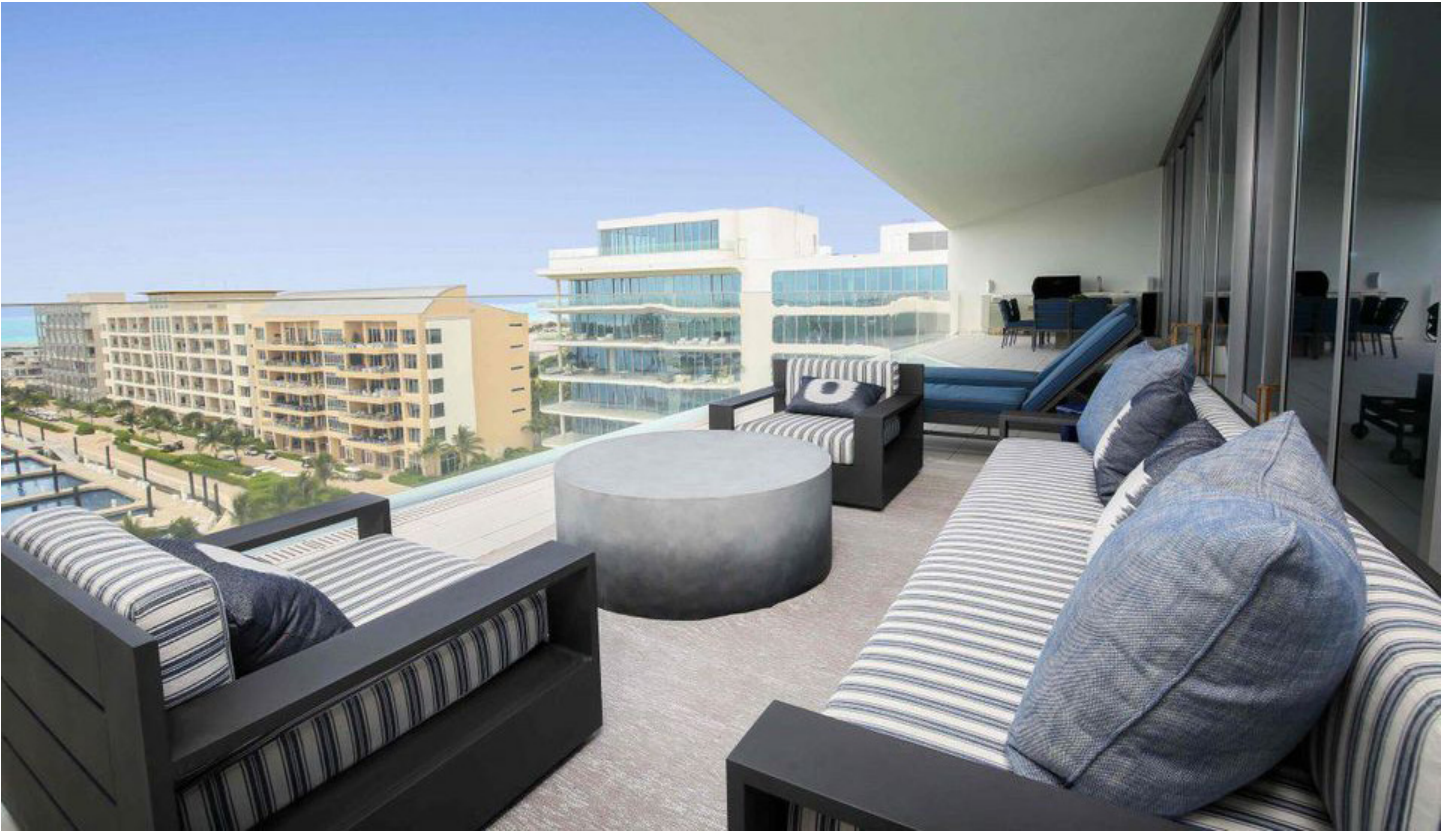
One of the residences in the Honeycomb building

With its modular block design (based on the famous computer game), Tetris will offer 25 sprawling, luxury apartments, starting at a price point of $5-6m and reaching around $20m for the penthouse properties. “I like to think of them as ‘houses in the sky’,” says Marie Kojzar , one of the Swedish architects responsible for the concept of Tetris. “These are set to impress – with panoramic views over the ocean, cantilevered lounges and grand terraces with sunken pools.”