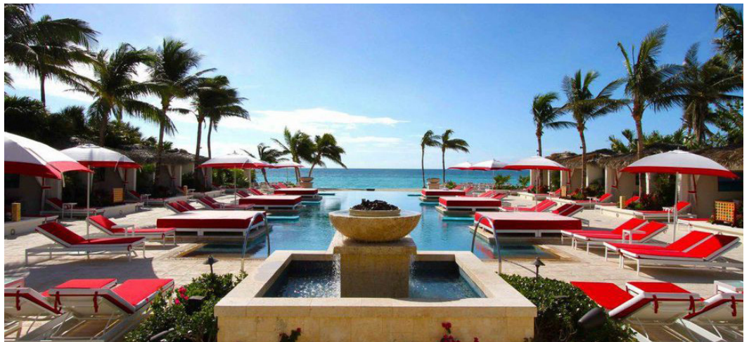
The Azul Pool