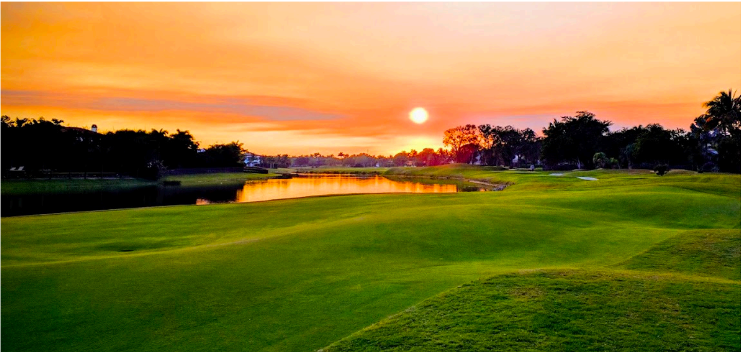
The Wellington will have extensive athletic facilities, including a field house and the revamped Cypress Golf Course.

An international developer backed by Tiger Woods and Justin Timberlake has joined an effort to build a sprawling residential community with stores and a revamped golf course in Wellington, a South Florida equestrian town near Palm Beach.